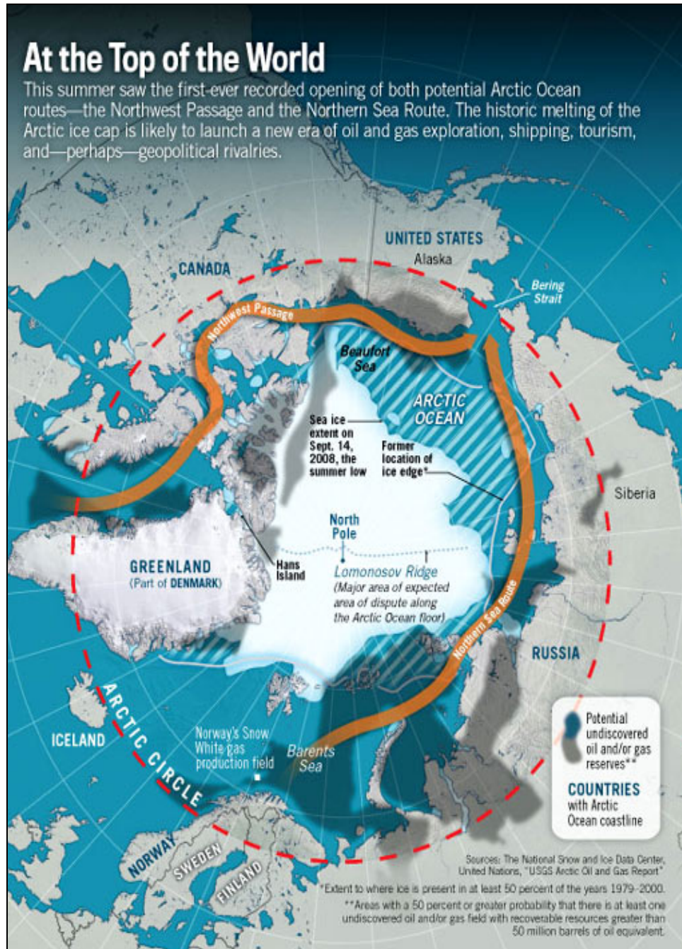
Figure 1. Arctic Sea Ice Extent in September 2008, Compared with Prospective Shipping Routes and Oil and Gas Resources